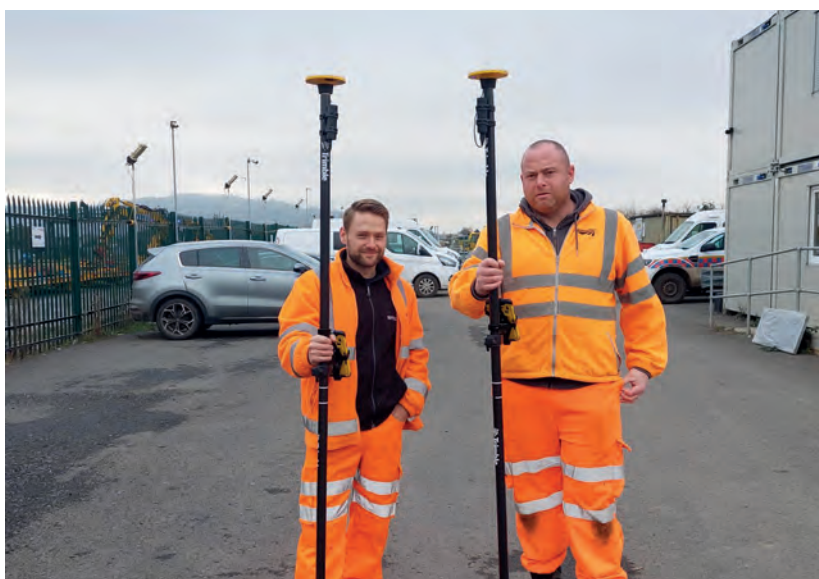
Team training with Trimble Catalyst

"We're known as the 'can do' team so our needs change annually, this year the focus is on access points, at other times it might be vegetation. We're always trying to evolve what we do and KOREC and Trimble Catalyst are an important part of how we can do this."