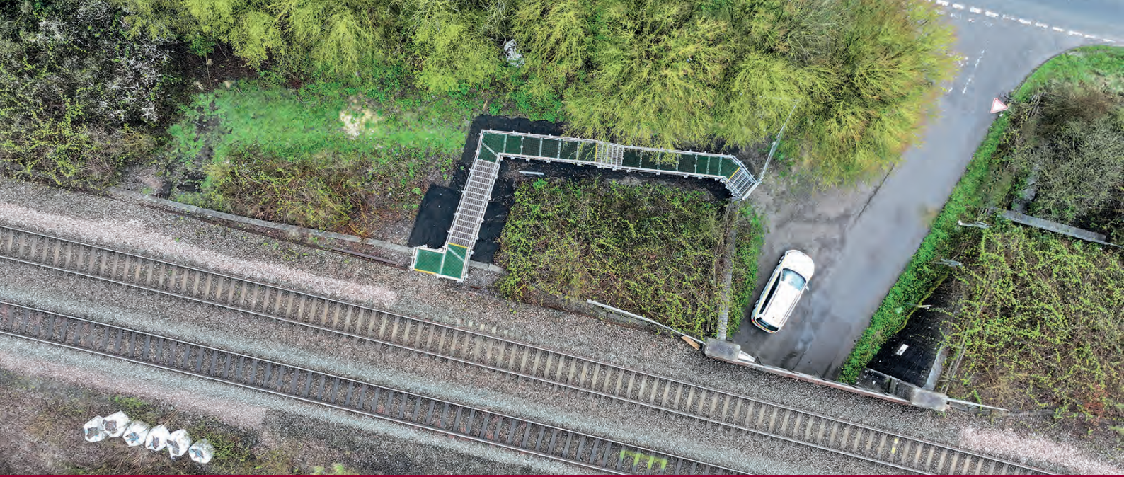
Showing the Feltham access platform - the Catalyst system was purchased a week into the install to ensure the team positioned it correctly

all the team's work is route based and often surrounded by vegetation. Catalyst's Trimble ProPoint technology provides increased performance in challenging GNSS environments, including close proximity to trees and tall buildings. This brought the added benefit of minimal removal of any vegetation around the area of work.