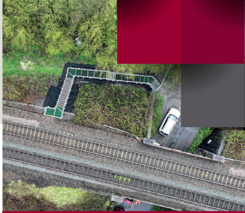
The access platform at Feltham where the Trimble Catalyst system was first used

Consequently, there was no fluidity to the team as those who were putting the screw piles into the ground had to wait for each position to be established manually. Sam felt that accurate positioning using a GNSS would dramatically increase site productivity.