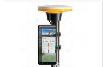
Trimble Catalyst is small, lightweight and affordable